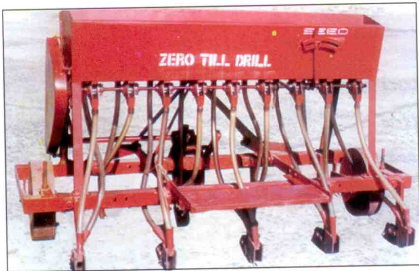
Fig 1 Tractor mounted zero till seed cum fertilizer drill

The Tractor mounted zero-till seed drill was initially developed at GB Pant University of Agriculture and Technology, Pantnagar and subsequently modified to the site needs (Fig. 1).