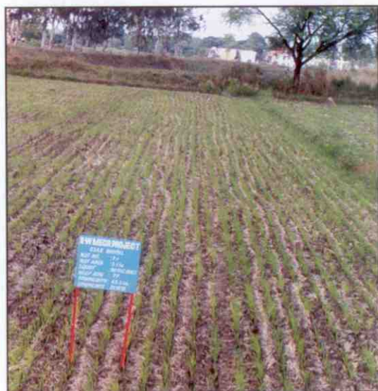
Fig 4 Zero-till drilled wheat (LOK-1) at 15 days of sowing